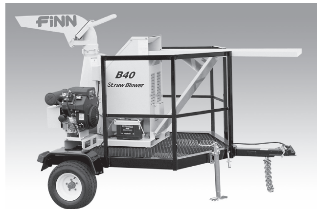
B40 Straw Blower Trailer Mounted (B40T)

As the world leader for over 70 years in the design and manufacture of innovative, quality equipment for the erosion control industry, FINN Corporation is committed to your complete satisfaction.