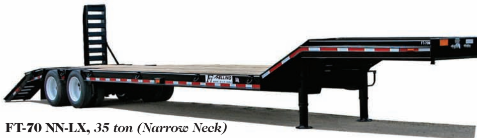
FT-70 NN-LX, 35 ton (Narrow Neck) with Optional motor grader ramps.

The FELLING HX (Flat Deck) is manufactured with a 16" H-Beam main frame and 10" Structural side rails to ensure strength and stability no matter your cargo.