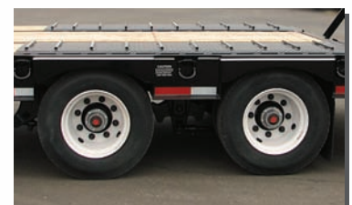
Opt. Covered Wheel Wells w/Traction Bars