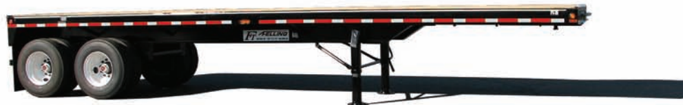
FT-70-2 HX, 35 ton (Flat Deck)

FELLING Rigid Neck Semi trailers are available with four neck angles; 90° neck with a 10' top deck, 45° neck with a 9' top deck, 30° neck with a 9' top deck or, 20° neck with 9' top deck.