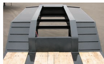
Opt. Motor Grader Ramps

The FELLING Narrow Neck Semi trailer is the economical answer for your hauling needs, this classic style trailer fits the bill.