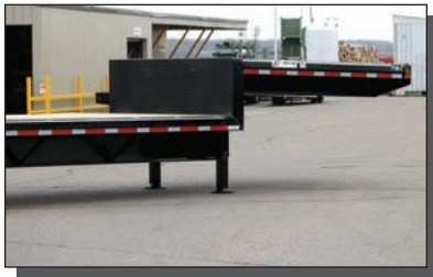
90 Degree Neck