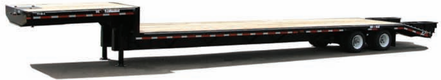
Above is the FT-70-2 MX, 35 ton - with a 10' top deck with 90° rise, white oak deck and Optional 5' beavertail with 5' spring-assist ramps.