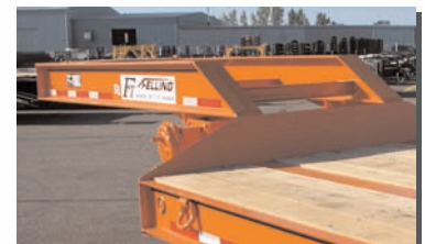
Standard Narrow Neck

The FELLING Narrow Neck Semi trailer is the economical answer for your hauling needs, this classic style trailer fits the bill.