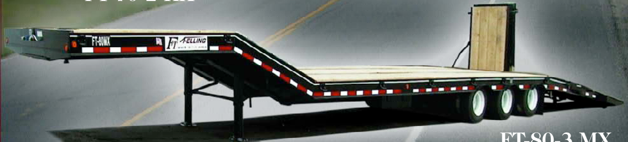
FT-80-3 MX with Bi-Fold Hydraulic Ramps