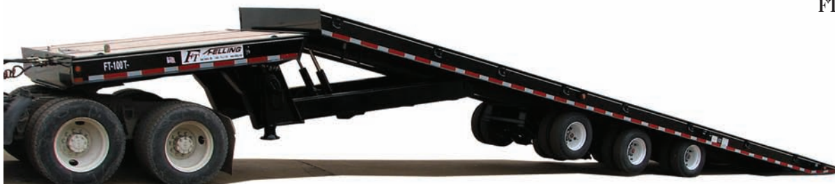
FT-100-3 MX-TD, 50 ton (shown above) standard with a 9' top deck and 90° neck.