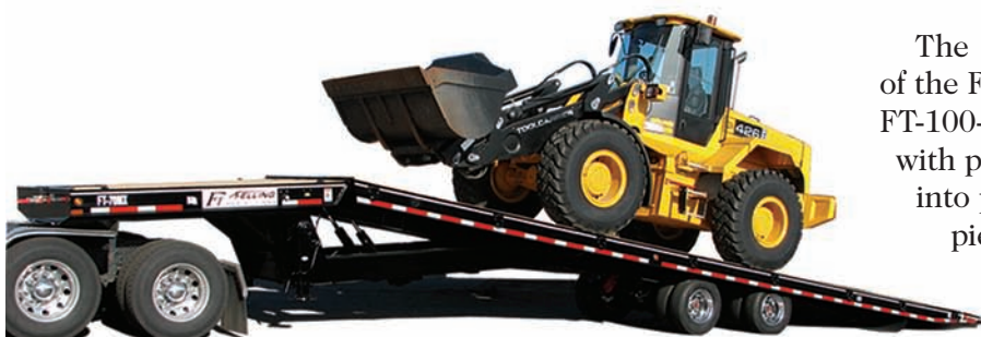
FT-70-2 MX-TD, 35 ton

The FELLING Tilt Deck Semi Line consists of the FT-70-2 MX-TD, FT-80-3 MX-TD and the FT-100-3 MX-TD. Equipped with twin cylinders with power up/down, the tilt bed can be locked into place while loading and unloading multiple pieces of equipment and then released to allow the tilt bed to float down into transport position.