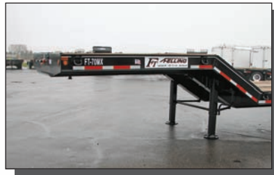
45 Degree Neck