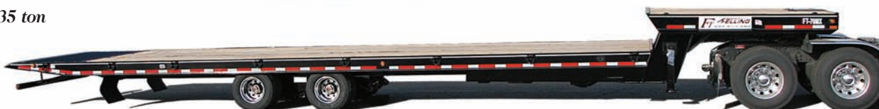
FT-70-2 MX-TD, 35 ton

The FELLING Tilt Deck Semi Line consists of the FT-70-2 MX-TD, FT-80-3 MX-TD and the FT-100-3 MX-TD. Equipped with twin cylinders with power up/down, the tilt bed can be locked into place while loading and unloading multiple pieces of equipment and then released to allow the tilt bed to float down into transport position.