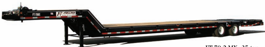
FT-70-2 MX, 35 ton with optional Hydraulic Tail and Winch

FELLING offers a broad range of deck options, one of them being the Hydraulic Tail which consists of an 8' hydraulic tail plus 4' fold under. The hydraulic tail provides additional useable deck space by folding under for transport. For loading and unloading, the tail raises upward to fully extend (to dock height if needed), then lowers to the ground to provide a ramp for ease in moving equipment on or off of the trailer.