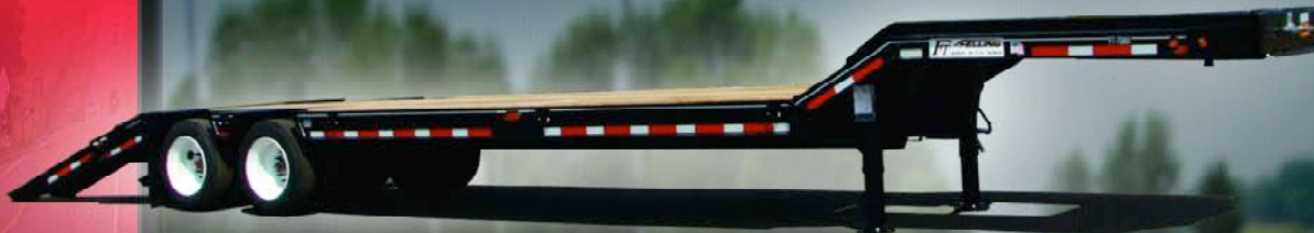
FT-70-2 NN-LX (Narrow Neck)