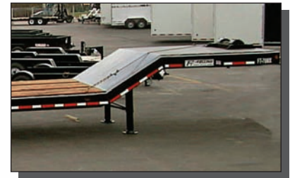
30 Degree Neck

FELLING Rigid Neck Semi trailers are available with four neck angles; 90° neck with a 10' top deck, 45° neck with a 9' top deck, 30° neck with a 9' top deck or, 20° neck with 9' top deck.