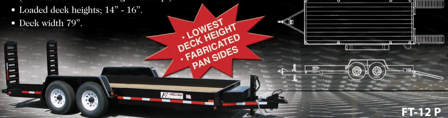
FT-12 P shown with optional toolbox.

FELLING DECKING OPTIONS DROP-DECK SERIES