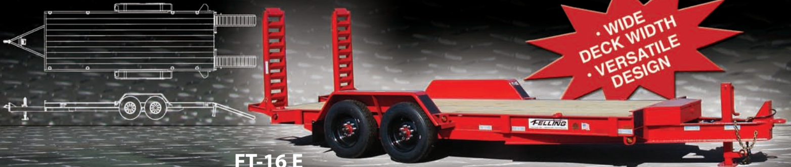
FT-16 E shown with optional toolbox, stake pockets and Viper Red paint.