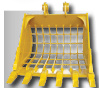
Ground Engaging Tools