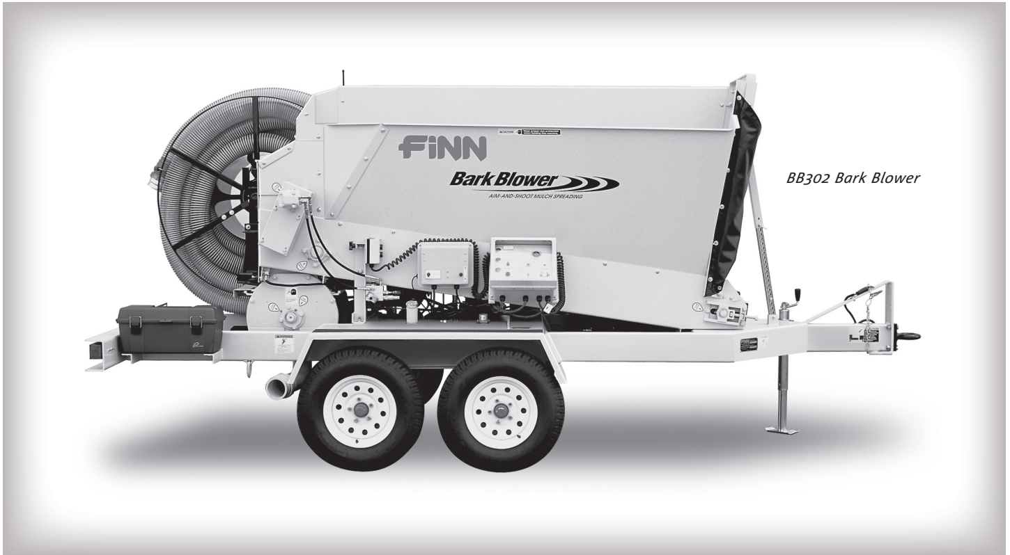
BB302 Bark Blower

The FINN BB302 Bark Blower applies landscape mulch and other bulk materials with unprecedented efficiency, and eliminates the need for labor-intensive hand application. The 1.5 cubic yard hopper is perfect for smaller jobs and hard to reach areas.