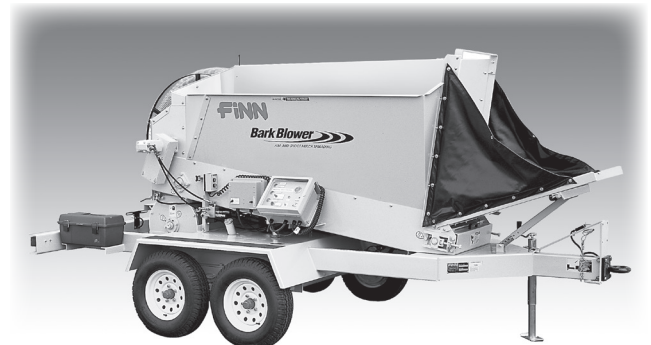
BB302 Bark Blower

As the world leader for over 70 years in the design and manufacture of innovative, quality equipment for the erosion control industry, FINN Corporation is committed to your complete satisfaction.