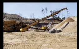
ST - SERIES