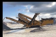
SR514 (2 / 3 DECK)