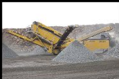
SR514 (2 DECK / 3 DECK)