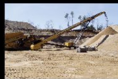
ST - SERIES ST80, ST60, ST50