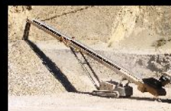
TR - SERIES