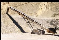
TR - SERIES TR75, TR60