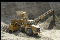
FTR - SERIES FTR150, FTR100