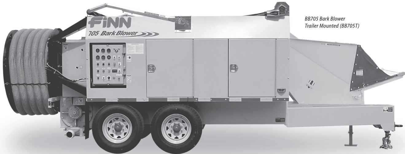
BB705 Bark Blower Trailer Mounted (BB705T)

FINN is excited to announce the addition of the new BB705 Bark Blower to its high-powered performance and productivity enhancing Bark Blower line. The new BB705 provides the ideal entry level option to the truck mounted power models. The BB705 has found its perfect niche integrating the technology and capabilities of the truck mounted series with the accessibility and operational ease of the trailer mounted units.